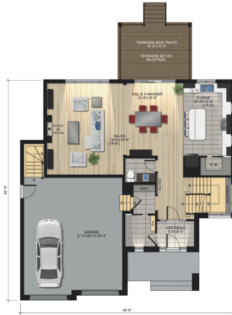
REZ-DE-CHAUSSÉE 1136 pi 2